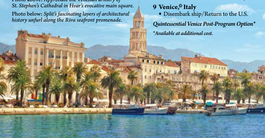
Photo below: Split's fascinating layers of architectural history unfurl along the Riva seafront promenade.

Photo above: Appreciate the Venetian artistry of St. Stephen's Cathedral in Hvar's evocative main square.