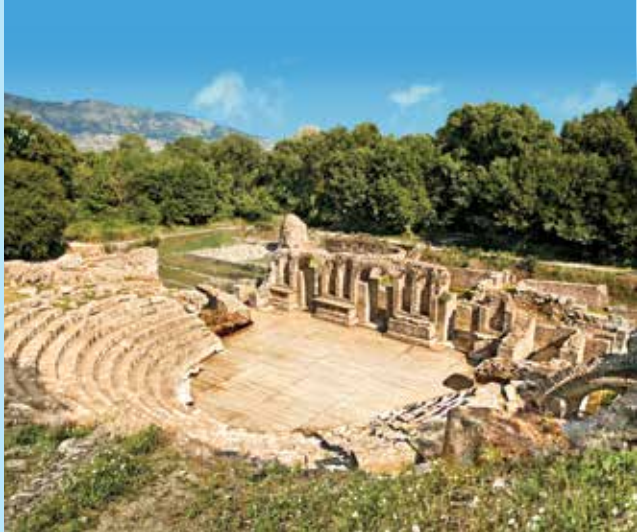
Visit Butrint's Greco-Roman theater, seating some 2500 people, a glorious distillation of cultural preeminence.

CULTURAL ENRICHMENTS: See Onofrio's Fountains, a beloved city landmark, and visit the 15 th -century Rector's Palace, the fascinating Maritime Museum and the Romanesque Franciscan Monastery's gorgeous cloister and historic pharmacy.