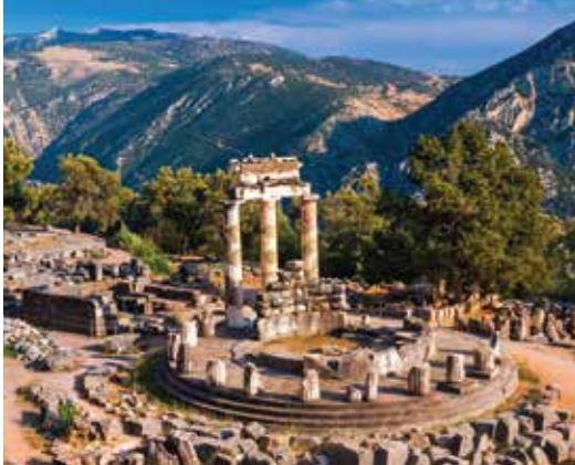
Admire the graceful Doric columns of the iconic Tholos of Delphi in the Sanctuary of Athena Pronaia.

PRSR STD U.S. Postage PAID Gohagan & Company