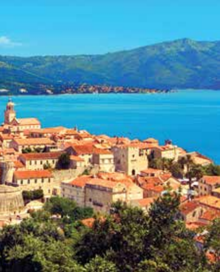
Korčula, a meticulously preserved medieval town and exceptional stonework.