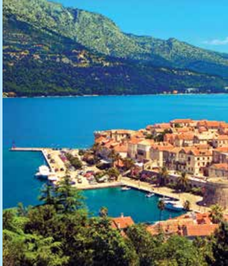
Be on deck for the unforgettable vision of stunning city rich in Renaissance and Gothic architecture a